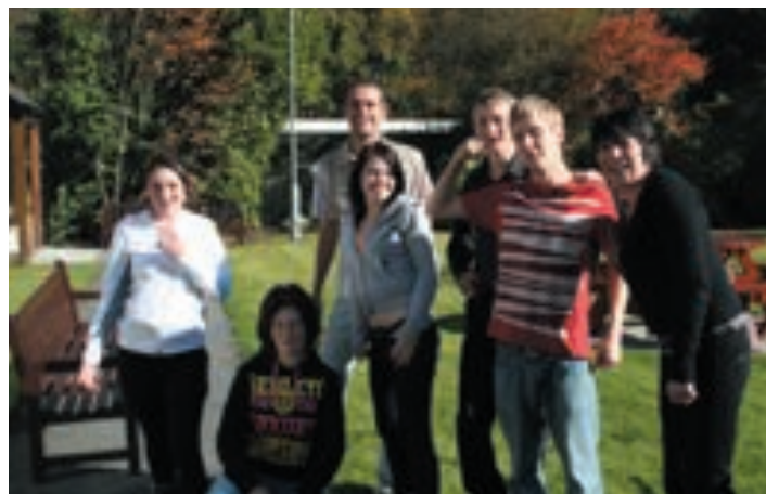
Young people from Gisda Theatre Forum who performed on the day

from the Assembly's Partnership Support Unit on Commissioning services (Partnership Support Unit), the Big Lottery and Voices for Change Cymru. Participants felt that they had had an enjoyable as well as an informative time, with opportunities to network and discuss issues that affect them.